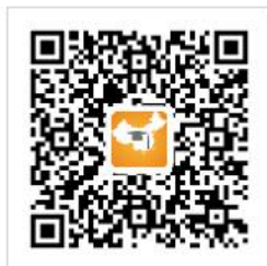
“Study in China” APP

(2) Please be noted that students in one of the following situations in recent 14 day will NOT be accepted to register :